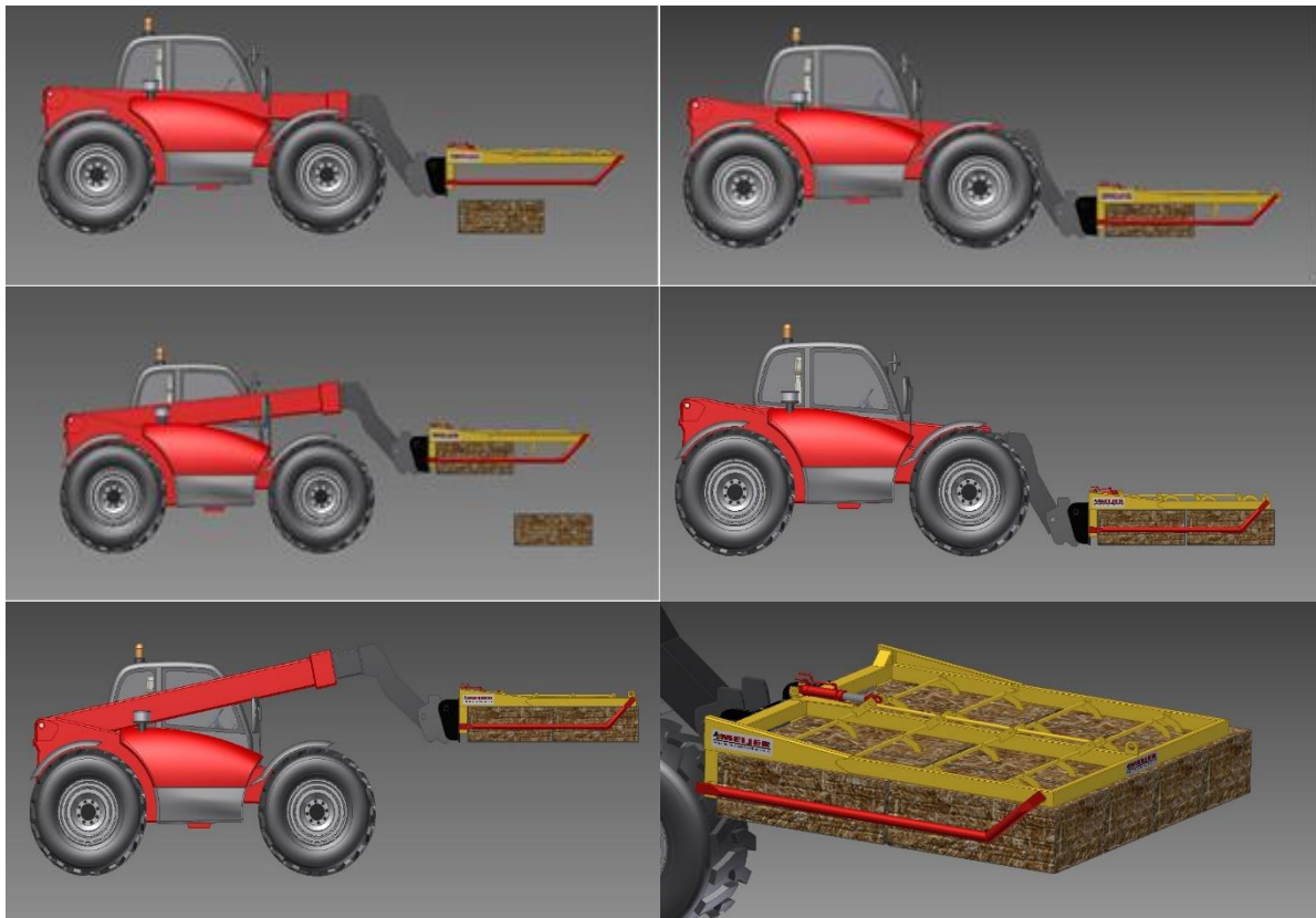
Use Meijer KM 8