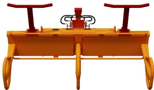
movement grab arms Jumbo VR4