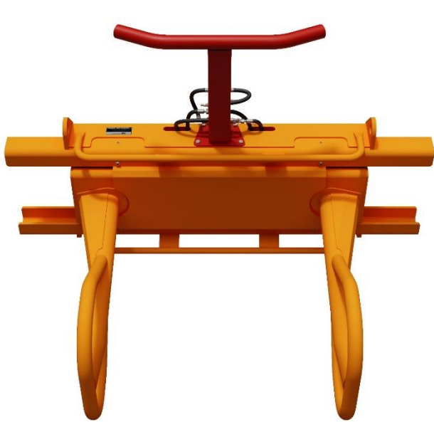
movement grab arms Jumbo VR2