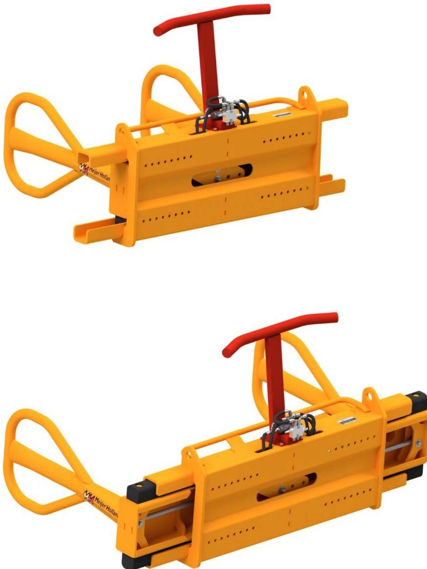
movement grab arms Jumbo VR2

The clamping of wrapped bales takes place with grab arms that are powered by hydraulic cylinders. Two grab arms slide outwards, each under pressure from a cylinder. This movement can be seen in the figure below.