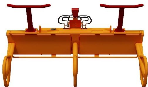
movement grab arms Jumbo VR4