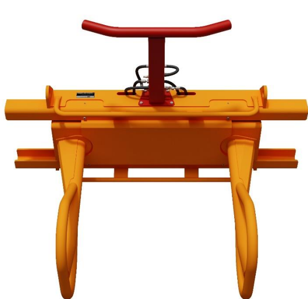
movement grab arms Jumbo VR2